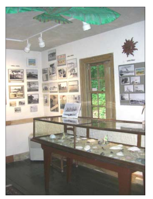
In 2010, about 700 visitors enjoyed the Ogunquit Heritage Museum with all its exhibits. The above room demonstrates how our famous Ogunquit Beach and its dunes had changed over the years.

All Friends and Guests are Inwited... Christmas By The Sea 2010 Open House at the Ogunquit Heritage Museum Saturday December 11 Sunday. December 12 1:00 - 5:00 p.m. Obed's Lane, Ogunquit, Maine Holliday Exhibits Refreshments